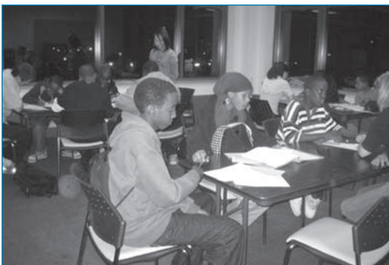
A Pathways to Education tutoring session

Look for our new Youth Clinic to start in the spring of 2008!