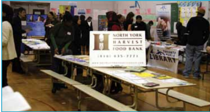
The Bathurst-Finch Network's first public event: a community conversation and agency fair. Conversations took place in English, Russian, Farsi and Korean.

So far, the network is made up of area residents and workers from community agencies, the City of Toronto and the Toronto District School Board. We have an interim steering committee, a general membership and are moving now to form sub-committees.